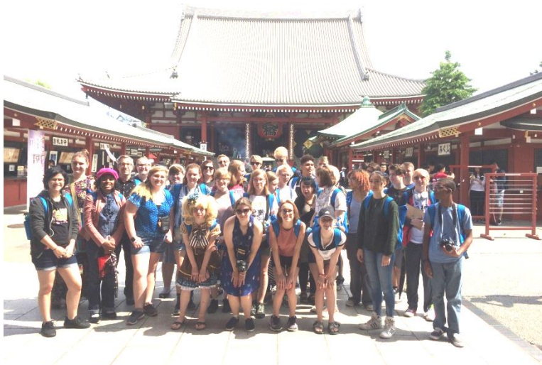
Travelers from the Land of the Rising Sun Tour 2017